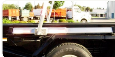
• Adjustable Sliding Pivot Fits Even Older Style Hoists And Adjusts Forward And Backward To Easily Accommodate Varying Length Containers From 10 To 50 Cubic Yards.