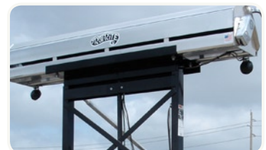
• Ask about High Capacity Housing Option for greater tarp capacity