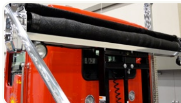
• Tower Rests at height of average 20yd can and extends 36" (Integrated Housing)

Tarp faster, safer and easier with Roll-Rite®. Adjustable sliding pivot offers widest range of coverage for rolloff trailers. Reduce load interference and increase operator safety with key-fob remote control. Remote control lets you monitor tarp operations standing where you want to not where you have to. Hydraulic motor and controls are also available. For special fit considerations, please call for availability of additional system variations.