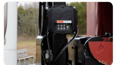
• Pre-wired Black Box™ Wireless Controls Are Standard